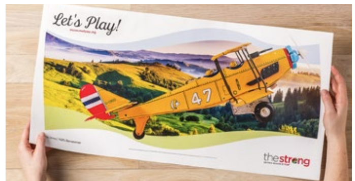
Extra-long sheet printing – maximum paper size 330 x 660 mm

It all adds up to better margins, higher profits and the ability to grow strategically with a single, future-proof investment.